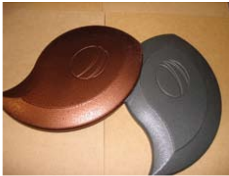
Unique colors and textures give great design appeal, such as hammertones, wrinkled finishes, granites, etc.