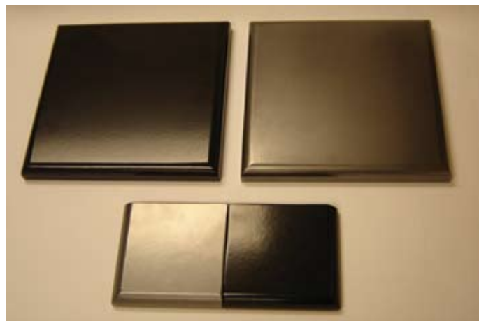
Powder-coated wood provides a very upscale, elegant appearance, such as high gloss black similar to a baby grand piano or metallic silver.

Because powder coating on wood is applied using a 5 to 8 mil