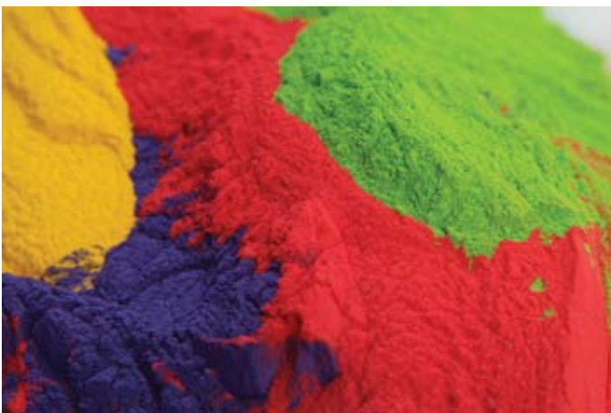
Powder coatings have a texture comparable to baking flour.